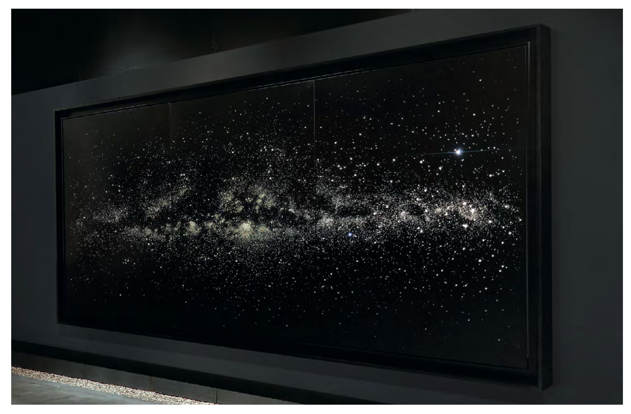
Sagittarius-A Nebula, at Manifesta 13 Marseille, 2020

"The star-field composition of Sagittarius-A Nebula is responsive to the viewer's location and speed of movement in the room. The shifting stars play on the eye, revealing itself as a responsive optical experience."