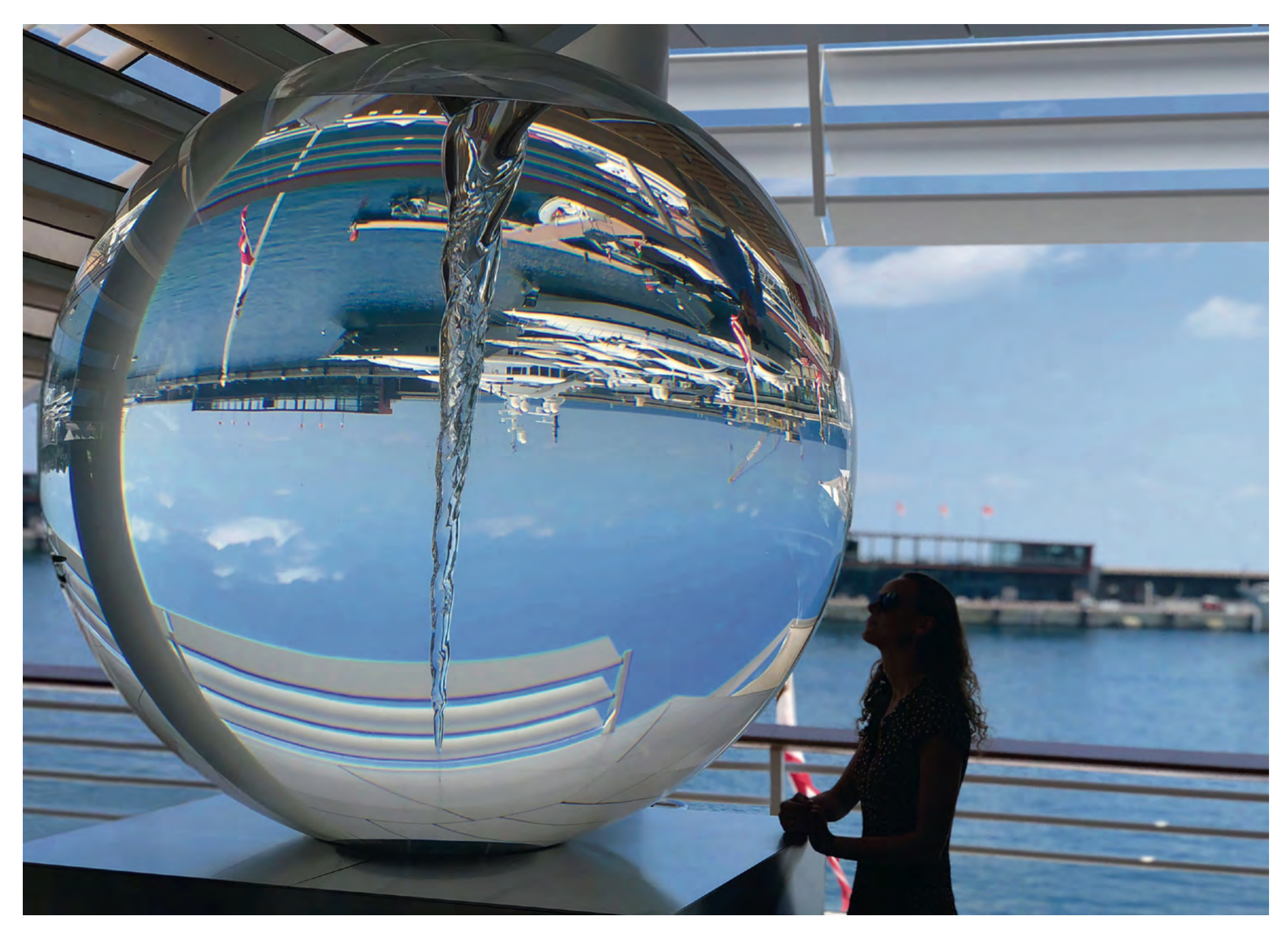
Literal Form (2016), installed at the Monaco Yacht Club building